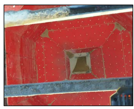
ABOVE K-Slide® UHMWPE Low Friction Liner installed in MS Bin.

Our customer in the Brisbane region is a manufacturer of precast concrete products and produces their own concrete on site. The manufactured sand is an essential ingredient in concrete mix, and of critical importance to the site's production.