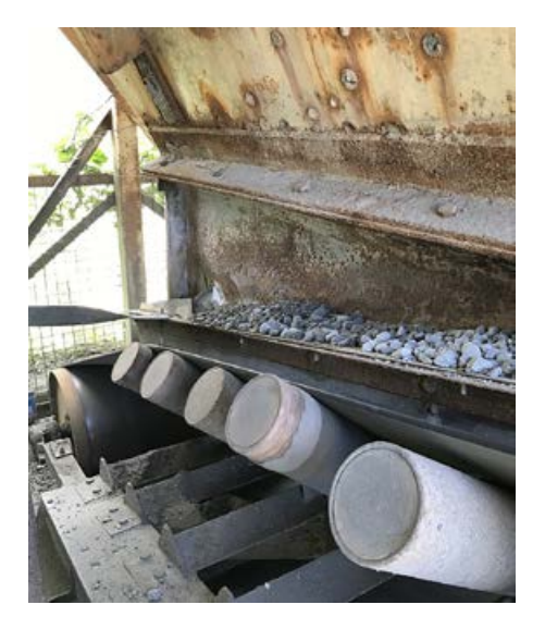
ABOVE: Before image showing the customer's spillage problem due to ineffective material containment at the transfer point.

Our established New Zealand quarry customer operates a busy concrete production plant. A transfer point located on one of their existing conveyor systems is situated in an awkward area for gaining reasonable access, inside/ underneath a drive-over bin. This was making the completion of any maintenance task such as the removal of spillage, very complicated.