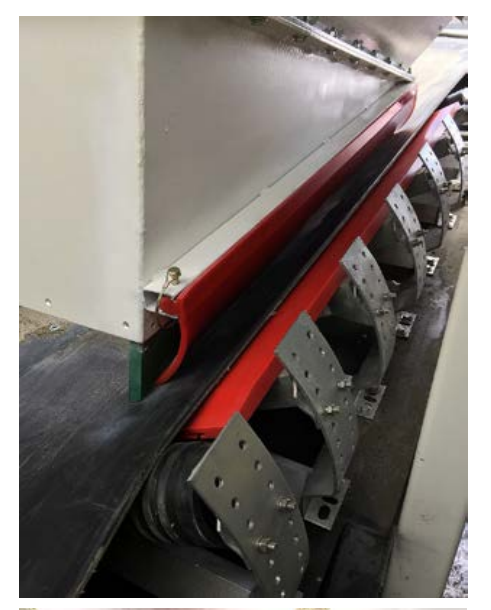
ABOVE: After image showing the installation of the product combination, outside and inside the chute. RIGHT: Video of effective transfer point in action >>CLICK VIEW

To significantly reduce the maintenance time as well as the complexity of the skirt adjustment task, we advised our customer to install a combination of belt support and skirting products.