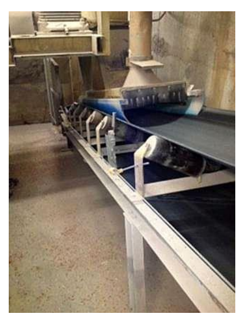
Photos of K-Snap-Loc® installed around the transfer point - the blue polyurethane indicates the Fire Resistant Anti Static FRAS properties.