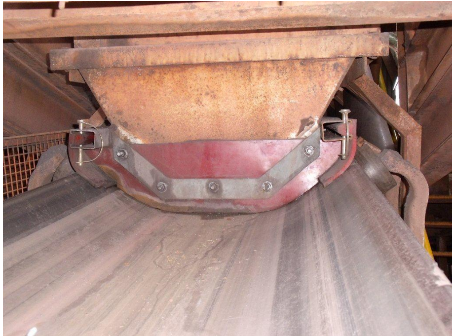
Full width photo of Port Pirie conveyor belt with polyurethane skirting K-Snap-Loc ® Dust Seal System