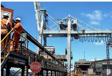
Photo on site of the Port Pirie bulk handling systems.

The area requires a green field approach to all aspects of bulk logistics at their facilities and so the existing clamped rubber skirting was not only causing wear and tear damage to the conveyor belt, but it was also creating a significant amount of bulk materials spillage.