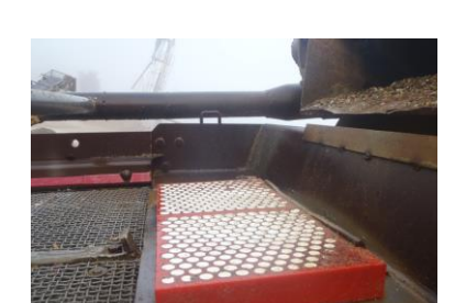
2011 photo of K-Redi-Liner® Ceramic in place after 6.5 years

"When the Kinder Australia sales engineers suggested that we try the K-Redi-Liner® lining panels I was quite doubtful that they would be able to replace the steel plate.