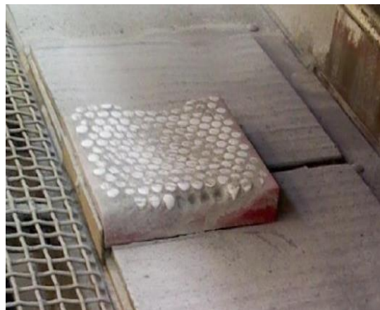
Photo taken on site at Leslie Vale Quarry 15 months after installation.